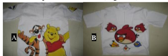
Figure1- Dentist's attire. A) pooh design B) angry bird design

Subjects were randomly assigned by permuted blocks into one of the three groups. The patients in the control group were seen by dentists wearing white coats, while the patients in the study groups were visited by dentists wearing coats with either Angry Birds or Winnie the Pooh cartoon characters printed on them (Figure 1).