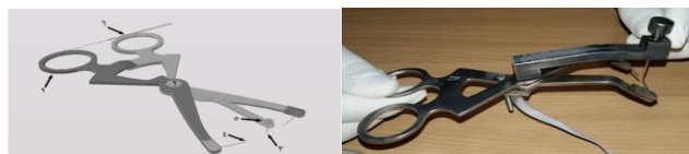
Figure 3- Mechanical part of the gauge includes (I) handles adjusting the horizontal pins, (II) location

microcontroller with the following components: (I) Display monitor, (II) microcontroller programming port, (III) microcontroller, (IV) 5V power supply, (V) power capacitor, (VI) LED power, indicating that the circuit is on or off, (VII) resistor for LED current control, (VIII) button to turn the circuit on or off, (IX) set button to adjust the zero point and calculate the angle relative to the zero set position, (X) resistor and Biasing IC AS5045 capacitors, (XI) connector connecting the main board to the sensors