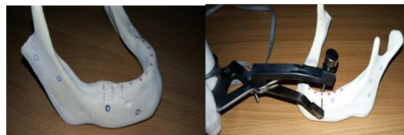
Figure 1- Edentulous mandibular model used for testing of the efficacy of newly designed bone gauge

(C) Testing efficacy on bone model: A total of 12 points were marked on an edentulous mandibular model. At each point, four levels (1, 2, 3 and 4 mm apical to bone crest) were marked with a waterproof copying pencil. Bone width was measured using the designed bone gauge and a digital caliper with 0.1 mm accuracy. All measurements were repeated twice by the same operator. The Pearson's intraclass correlation coefficient (ICC) was calculated for the data obtained by the designed bone gauge and digital caliper (Figure 1). The instrument was first designed in a computer and then in the Robotic Laboratory of Amir Kabir University. The electronic board of the instrument includes several components as shown in Figure 2, and Figure 3 shows the mechanical part of the instrument.